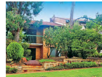
5/15 Lawley Crescent