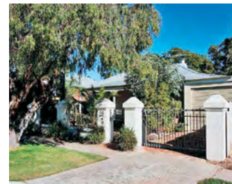
25 Coode Street