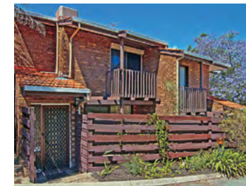
2/16-18 Queens Crescent