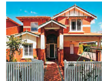
82B North Street