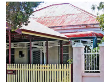
62 Clarence Street