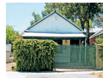
48 Forrest Street