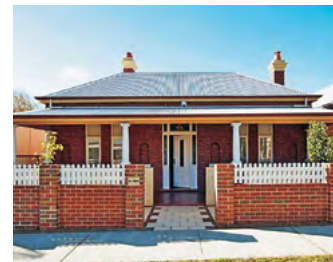
98 Harold Street