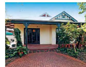
36 Grosvenor Road